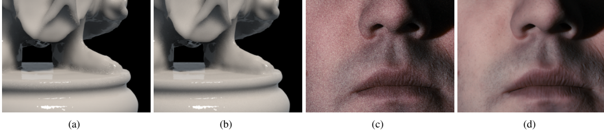
figure 1: Simple BSSRDF without (a) and with (b) axis MIS (25 spp). Complex BSSRDF without (c) and with (d) weight MIS (16 spp).

Light propagation within translucent materials can be described by a BSSRDF [Jensen et al. 2001]. The main difficulty in integrating this effect lies in the generation of well-distributed samples on the surface within the support of the rapidly decaying BSSRDF profile. Jensen suggested that these points could be importance sampled but did not provide implementation details. More recently, Walter et al. [2012] and Christensen et al. [2012] proposed other sampling methods which can still suffer from excessive variance.